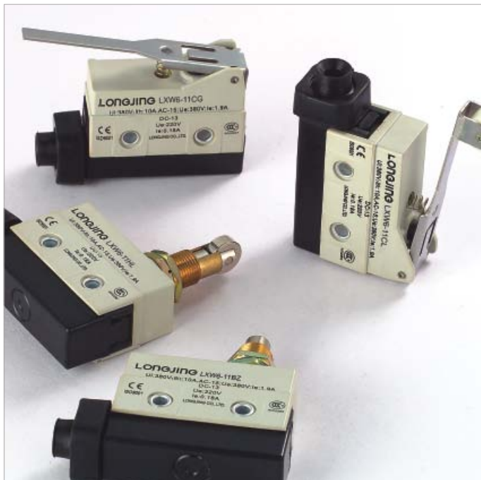
接触形式 Contact type